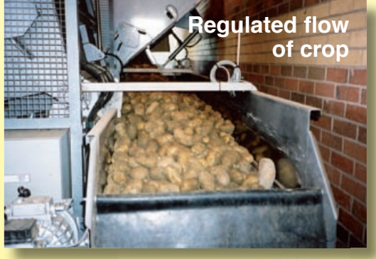
Tickhill Engineering Co Ltd

COW HOUSE LANE, ARMTHORPE, DONCASTER, SOUTH YORKSHIRE DN3 3EE - UK Tel: +44 (0) 1302 831911 Fax: +44(0) 1302 300173 - email sales@haith.co.uk Website www.haith.co.uk