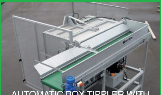
AUTOMATIC BOX TIPPLER WITH CROSS CONVEYOR

For compact and gentle box handling PATENTED