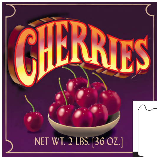
Front of Label - Faces away from package, towards consumer.