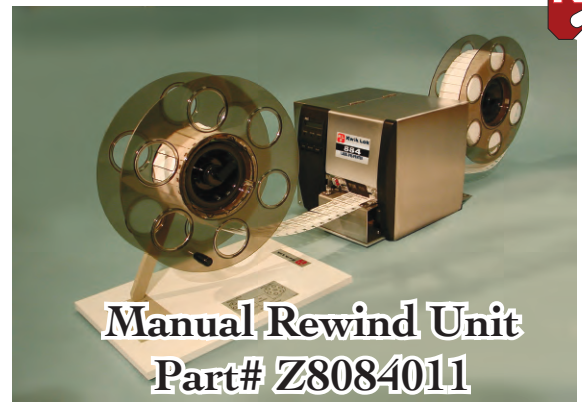
Manual Rewind Unit Part# Z8084011

Rewind units are available either as an automatic or manual configuration. After printing, labels are rewound for use with Kwik Lok's 865, 087 and 088 Bag Closing Machine. The automatic rewind includes a rack for storing reels.