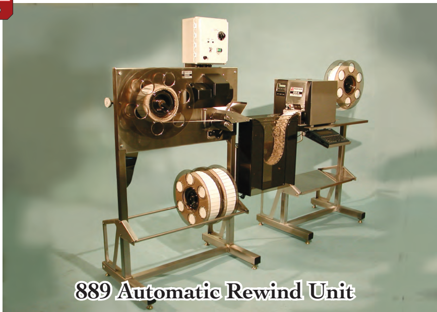
889 Automatic Rewind Unit