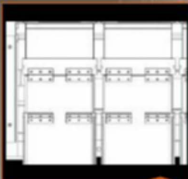
XBDG weigh head detail (front)

The DG-series took its name from the distinct Double opening of the weigh head and Gulerod ; the Danish word for carrot.